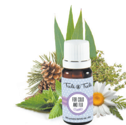
For Cold and Flu