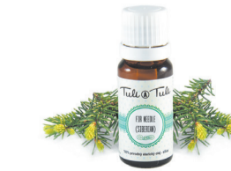
Fir Needle (Syberian)