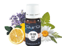
For Good Sleep